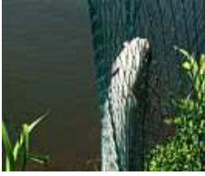
Forelle im Kescher

... it's very exciting. But maybe the fish is too small to take with you? Please check every time whether the fish you caught meets the minimum size listed in the fishing regulations and maybe on your fishing pass as well. You can find a selection of these minimum sizes on the table on the back of the card. If the fish is too small, it has to be put back in the water, so that it can continue to live and grow. Please carefully remove the hook, or if the fish has swallowed the hook too deep, cut the line at the tip of the head, and let it swim away quickly.